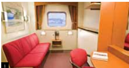
1 | CABIN CATEGORY U 2 | SUITE CATEGORY M 3 | SUITECATEGORY Q

Cabins 331, 333 and 335 adapted for guests with disabilities. Category J and QJ and some L grade cabins have limited or no view. Subject to change.