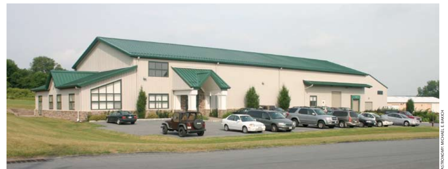
ASTRONOMY: MICHAEL E. BAKICH

AL NAGLER’S DESIGN NOTEBOOK sits open to the page showing the original drawing and specifications for the first Nagler eyepiece — the 13mm — rests atop the notebook.