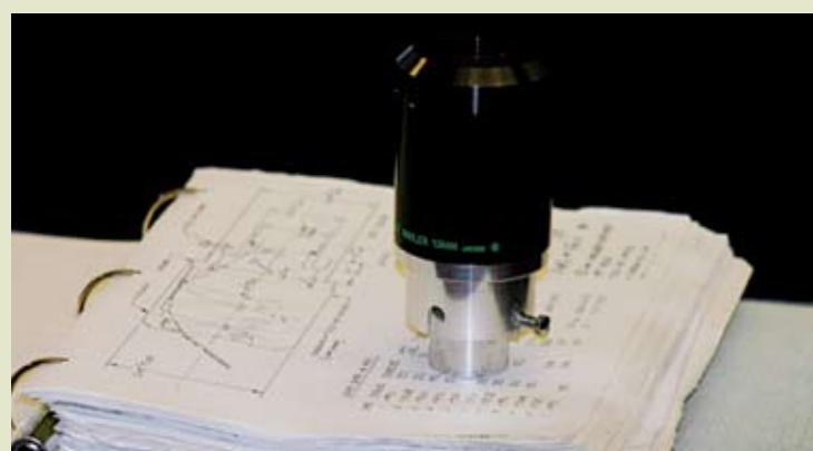
ASTRONOMY: MICHAEL E. BAKICH

AL NAGLER’S DESIGN NOTEBOOK sits open to the page showing the original drawing and specifications for the first Nagler eyepiece — the 13mm — rests atop the notebook.