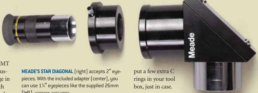
MEADE'S STAR DIAGONAL (right) accepts 2" eyepieces. With the included adapter (center), you can use 1½" eyepieces like the supplied 26mm (left).

The 14-inch LX200GPS-SMT also comes with the AutoStar Suite, which includes Meade’s Lunar Planetary Imager and a software package. You can use the AutoStar Suite to guide the telescope from a notebook or desktop computer and to perform basic imaging of bright objects.