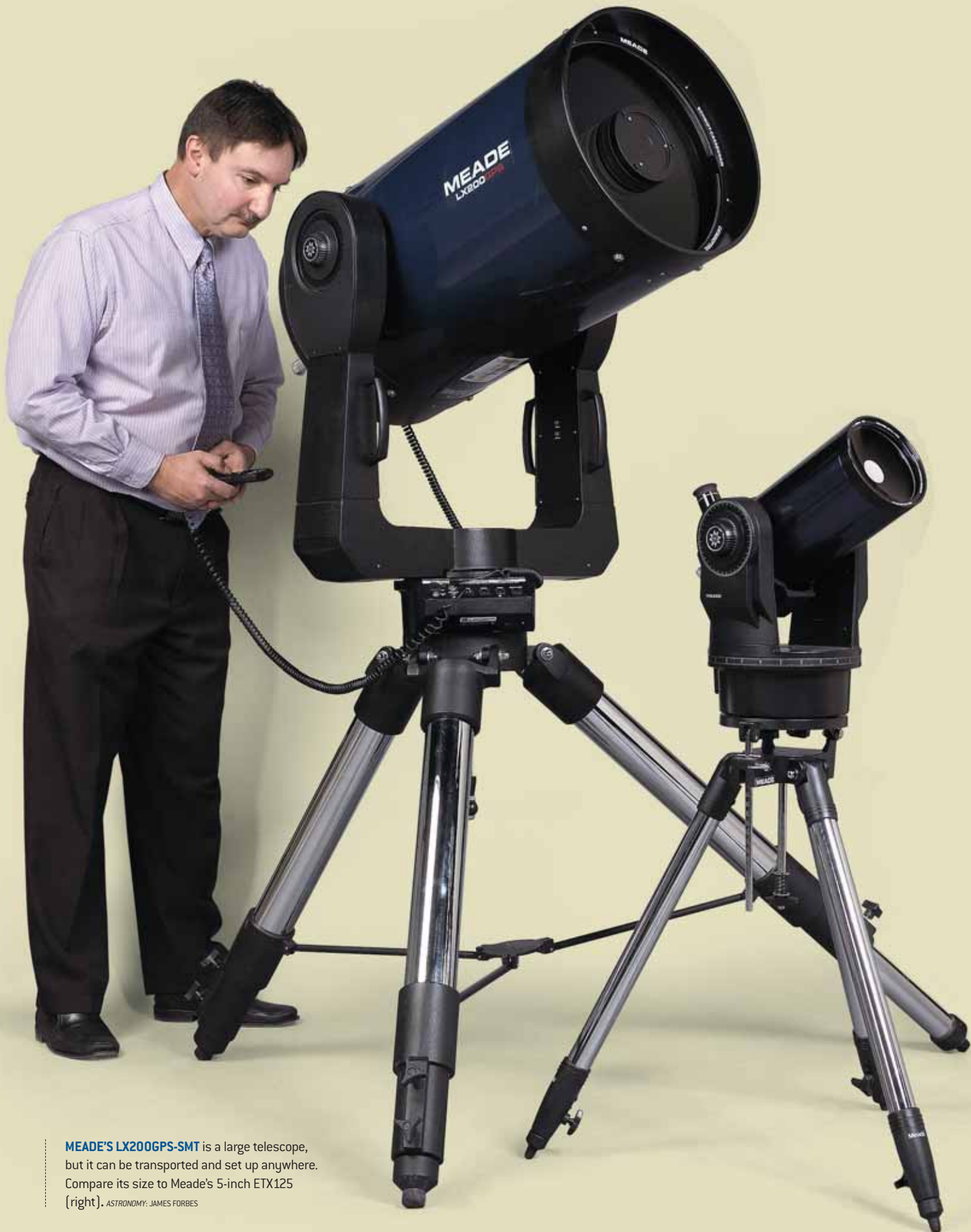
MEADE'S LX200GPS-SMT is a large telescope, but it can be transported and set up anywhere. Compare its size to Meade's 5-inch ETX125 (right).