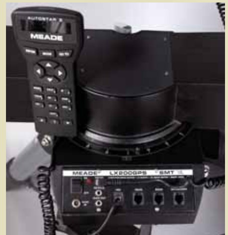
THE CONTROL PANEL of the LX200GPS-SMT has inputs for the handbox controller, an external computer, and an autoguider — 12 volt DC power is also supplied. ASTRONOMY: JAMES FORBES

Meade's tests show the UHTC, when averaged over the entire visible spectrum, increases light transmission to the telescope focus by about 15 percent. The telescope I tested came with the UHTC, and although I did not have a non-UHTC 14-inch scope for